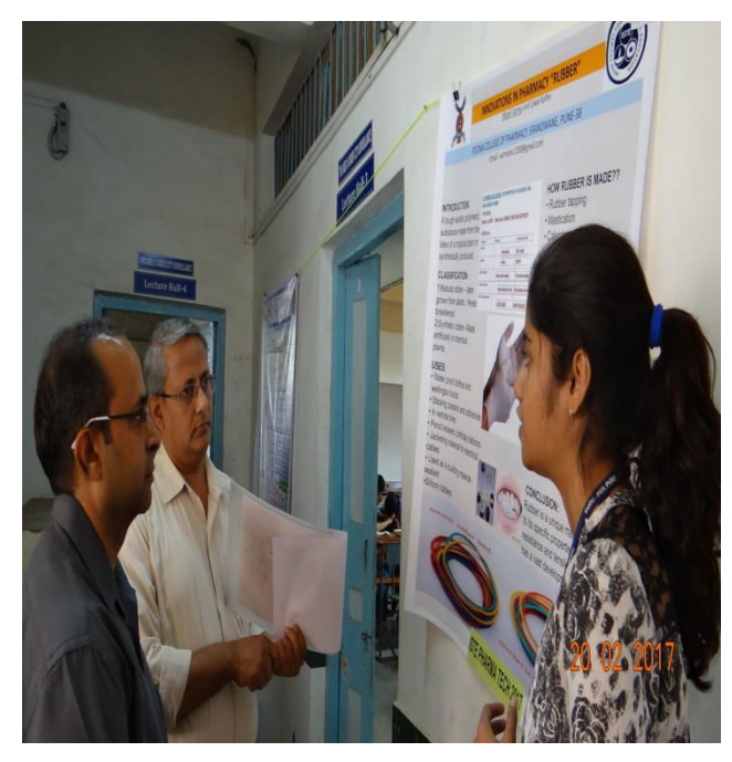
3. Presentation and defense: 15 marks Total: 50 marks.