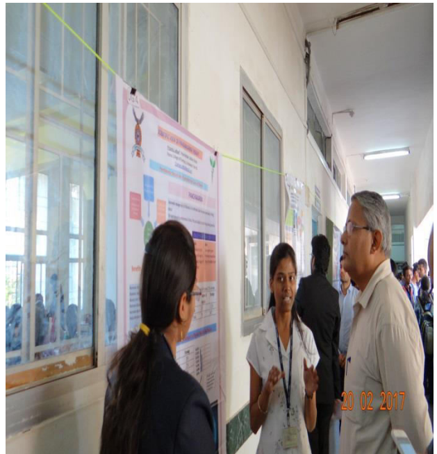
2. Content of Poster: 20 marks