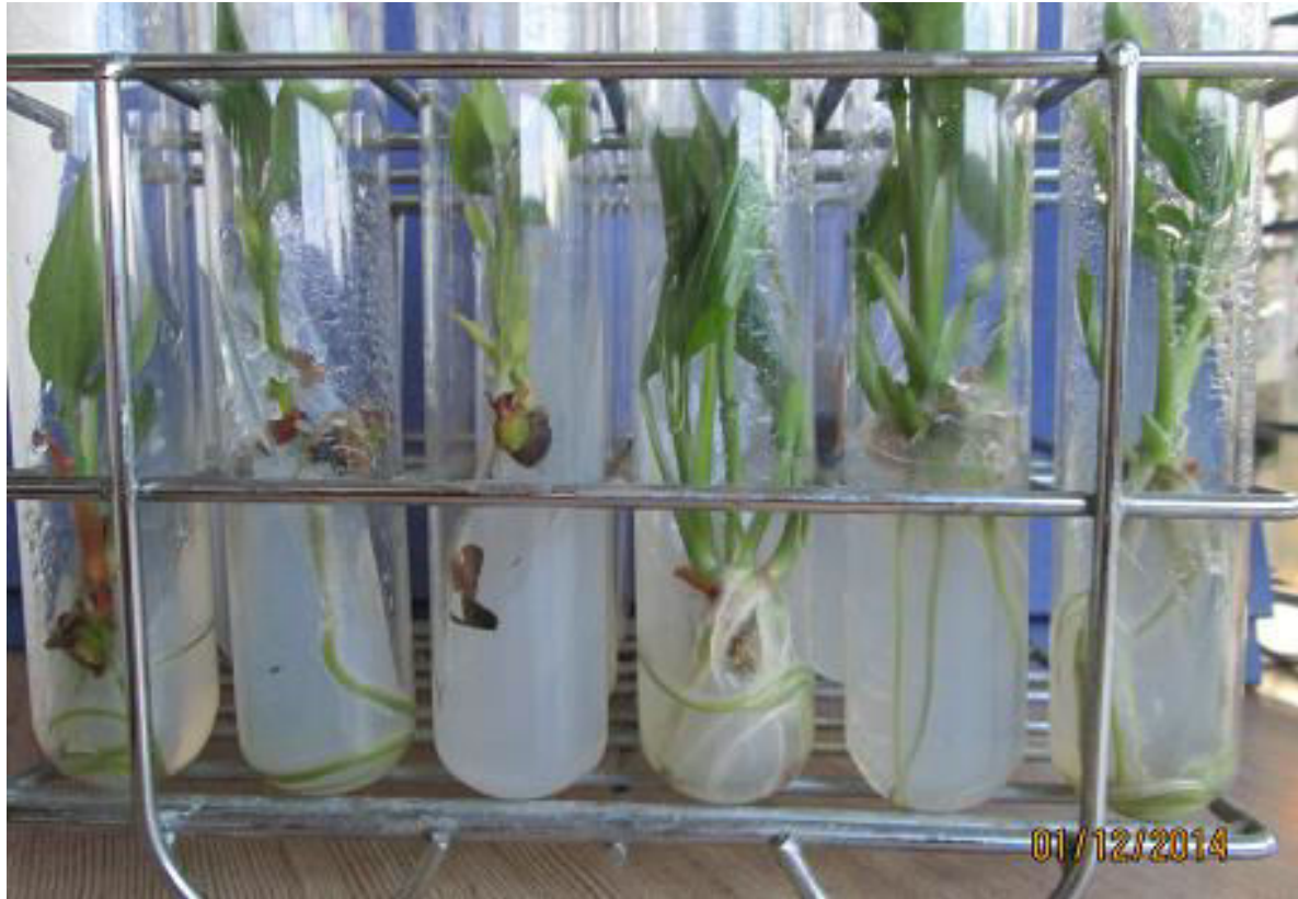
Figure 3: Micropropagation in Alpinia galanga