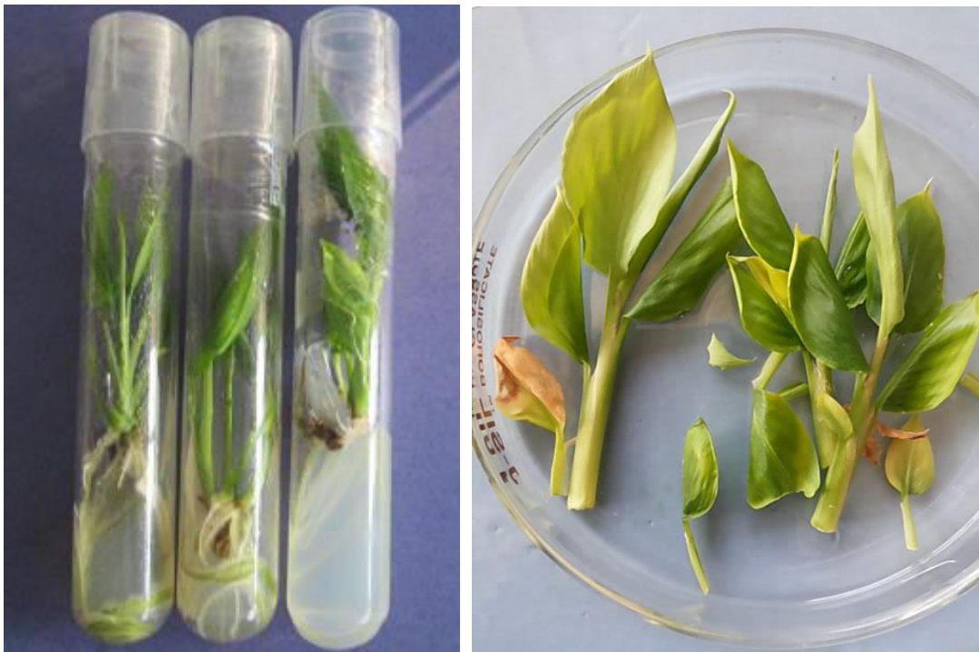
Figure 2: Micropropagation in Alpinia galanga